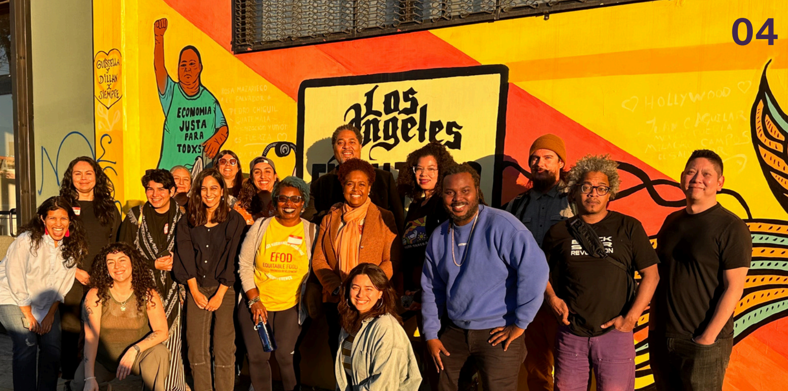
Photo Description: EFOD Steering Committee members strategizing in Los Angeles, pictured in front of SC member org Inclusive Action for the City